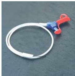
COMPAT® STAY-PUT Nasojejunal Tube