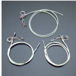
COMPAT® Nasogastric Tubes