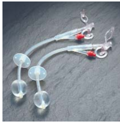
COMPAT® Replacement Balloon Gastrostomy Tubes