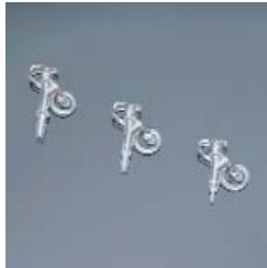
COMPAT® Y Adapters