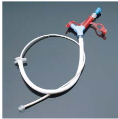
COMPAT® Surgical Gastrojejunostomy Tube