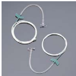
COMPAT® Needle Catheter Jejunostomy Tubes

Enteral Feeding Tubes Product Reference Guide